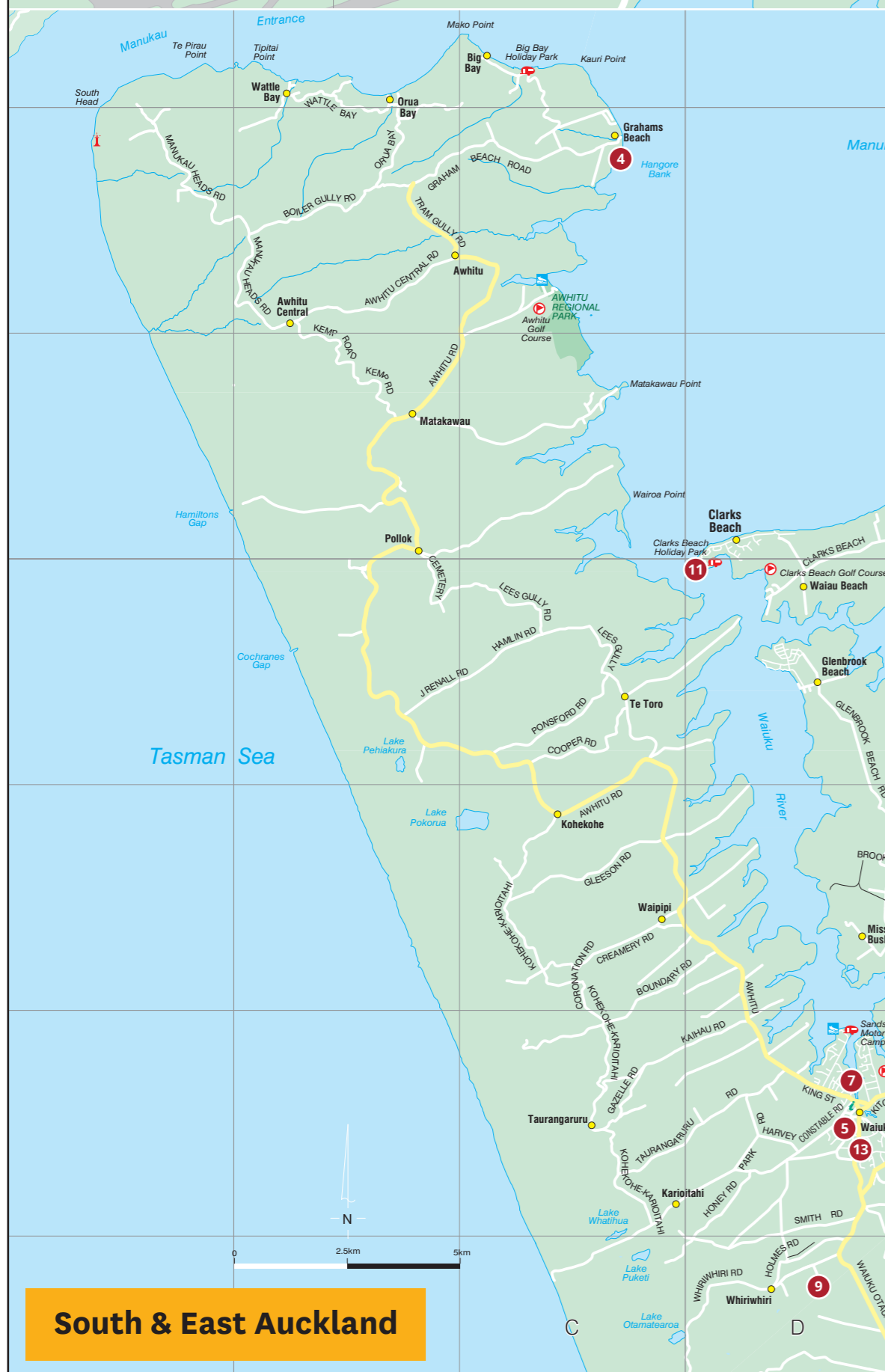
South & East Auckland