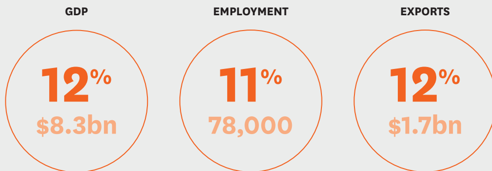
Figure 1: Advanced industries’ contribution to the Auckland economy

Auckland’s advanced industries make up a distinct segment of the Auckland economy, contributing a small but significant proportion of Auckland’s economic performance and output. In 2015, they contributed 12 per cent of Auckland’s GDP, 11 per cent of employment, and 12 per cent of total export revenue coming into Auckland.