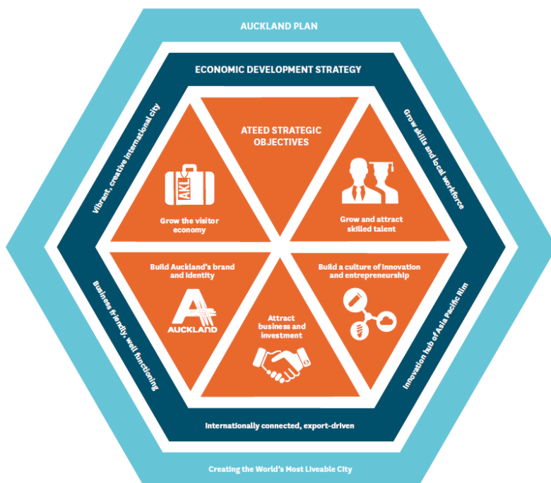
Figure 3: ATEED’s Strategic Objectives

Through these objectives we can connect Auckland wide strategies (Auckland Plan, Economic Development Strategy) and ATEED’s ongoing strategic interventions, growth programmes and projects. The framework below provides the organisation with focus on those areas of our role that will make a difference to Auckland. The key strategic objectives are supported by more detailed action plans, investment proposals and delivery partnerships.