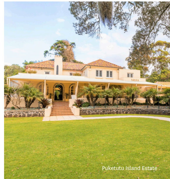
Puketutu Island Estate

Taonga Tuku Iho. Our symbol for handing on knowledge.